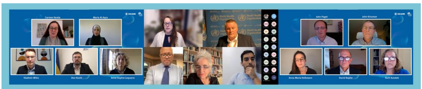
Discussions at side events at ESCAIDE

Alongside a packed scientific programme, many side-events were hosted at ESCAIDE this year. The EPIET Alumni Network hosted a session discussing opportunities for career development for conference attendees and a BarCamp session. ECDC held a session to share lessons learned in gathering information on non-pharmaceutical interventions and another one on the impact of the MediPIET programme in neighbourhood countries. The SONAR-Global project shared results on using social science methods for infectious disease prevention and control. These were very well attended and engaged with by attendees at ESCAIDE 2021!