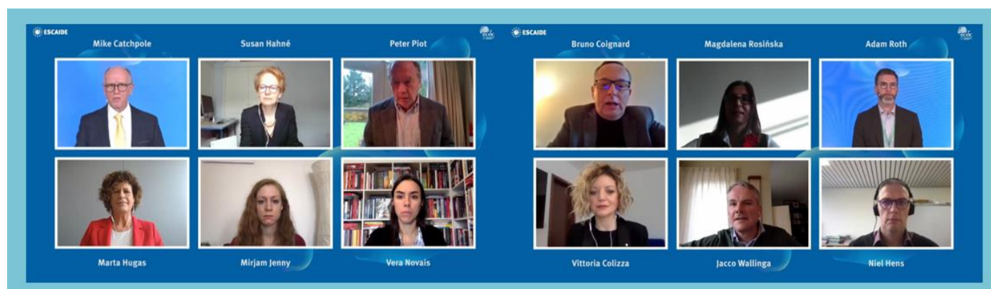
Speakers in Plenary A and Plenary B

Prominent, multi-disciplinary speakers from across Europe and the world contributed to the plenary sessions, put together by the ESCAIDE Scientific Committee to provide a platform to discuss and debate topics with significant current importance in infectious disease public health.