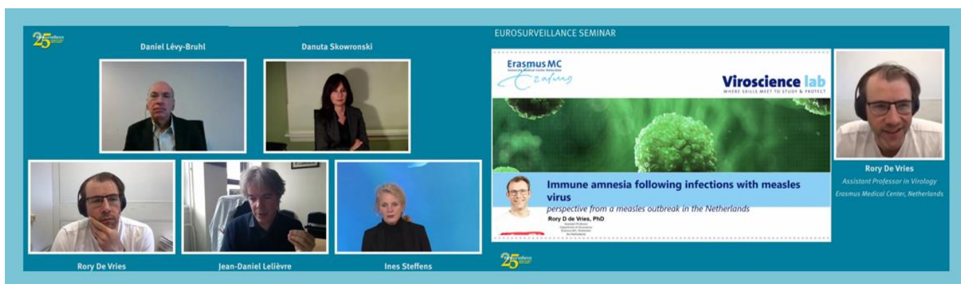
Speakers and presentations at the Eurosurveillance seminar

The three cutting edge papers presented covered influenza, measles and COVID-19 respectively, through a mix of epidemiological, virological, immunological and public health policy perspectives. Intense debates and a flurry of questions came from the comments section for each of the three papers, as the novel insights being presented on infectious disease epidemics are directly relevant to the reality that we are all currently living with.