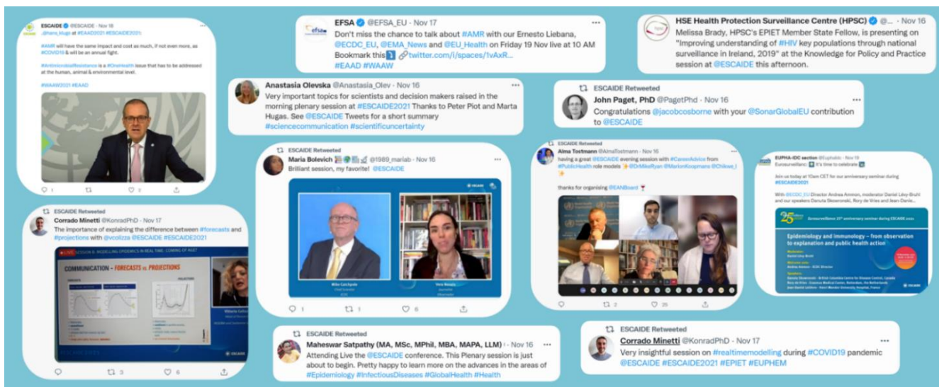
Posts on Twitter and Facebook from ESCAIDE attendees, speakers and organisers

Our Twitter, Facebook and LinkedIn were flooded with tweets from participants, presenters, moderators, speakers, and organisers who publicised events, commented on research and created an online buzz about ESCAIDE. It was great to hear directly from the audience and see peer support within the infectious disease community!