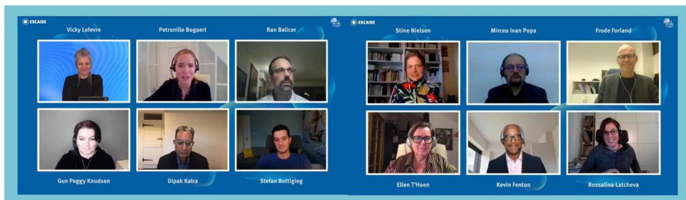
Speakers in Plenary C and Plenary D

In the plenary on digital health, experts presented apps and platforms developed for digital COVID-19 contact tracing in Norway, Malta and Israel, and how the lessons learned can be taken forward and applied to other infectious diseases. The message was clear: these technologies exist in the here and now, so what is important is building public trust to ensure their potential is reached in public health.