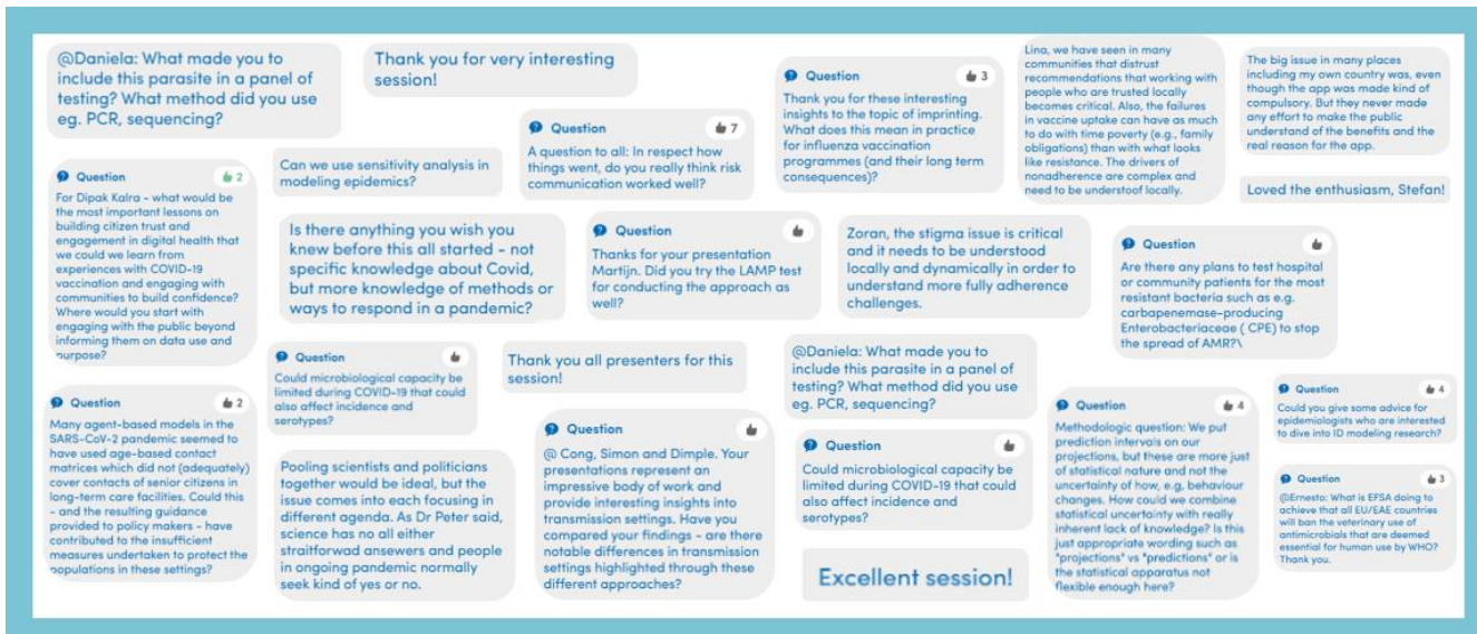
Comments made in the live discussion box during sessions at ESCAIDE

There was fantastic engagement on our online platform during the conference, with many questions asked during sessions and messages exchanged between participants. We were pleased that the dynamic exchange of ideas, support and debate could still take place in the online environment. This makes ESCAIDE what it is, so thank you for your contributions to the conference!