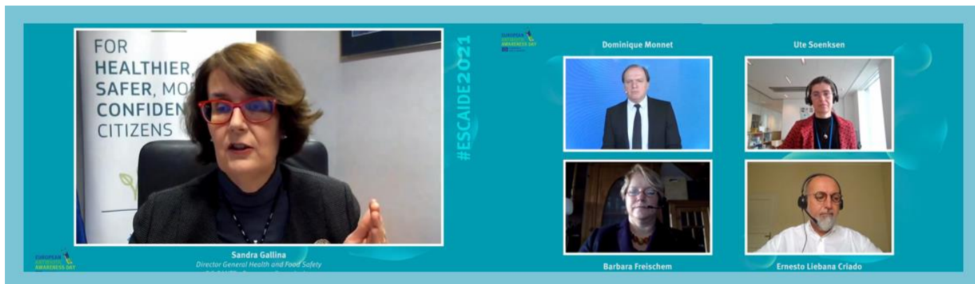
Speakers in the European Antibiotic Awareness Day event

This was followed by a panel discussion from key experts, who presented new data from ECDC and discussed the continual need to increase awareness among medical professionals, policy makers and the public. The campaign continued online – you can read more here .